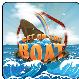
Vacation Bible School 07.19 - 07.22 cbc.social/events