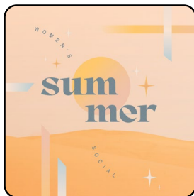
Women's Social 07.12 cbc.social/women