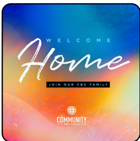
Welcome Home 06.28 cbc.social/events

Love San Antonio is a two-week opportunity for you, family and friends to be good news to the people and places around you. Visit LoveSATX.com to search available projects by location, date or category, and find the perfect missional opportunity for your crew to engage with!