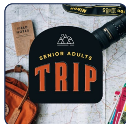
Senior Adults Day Trip 11.10 cbc.social/events