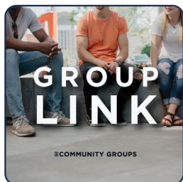
Group Link 10.10 & 10.17 cbc.social/events