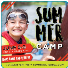
Kids Camp 06.05 - 06.09 cbc.social/kidscamp

This weekend CBC hosted one of the largest student ministry events we do all year. Hundreds of students and leaders from CBC, along with 8 other partner churches throughout the city, gathered for an amazing weekend conference, ONE WKND! This annual weekend has become a defining one for CBC Students as they experienced worship services, small groups, Mega Meal missions outreach and even a silent disco dance party! Our students were reminded of what has always been true but is sometimes forgotten: we love better, are stronger, are healthier, when we are together. We believe this weekend experience will be a launching point of some incredible things that God wants to do in our church and in our city. We are so thankful for a church that values this generation of students!