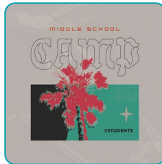
Middle School Camp 06.19 - 06.23 cbc.social/mscamp