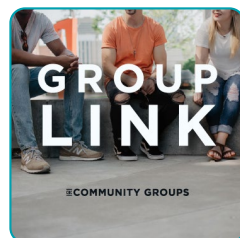
Group Link 04.11 & 04.18 Text 'group' to 210.762.4747