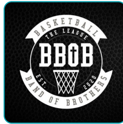
BBOB Tryouts 03.29 cbc.social/bbob