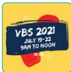
VBS 2021 07.19 - 07.22 cbc.social/vbs

▶▶ SERVICE TIMES Saturday - 5PM | Sunday - 9AM, 11AM, & 1PM