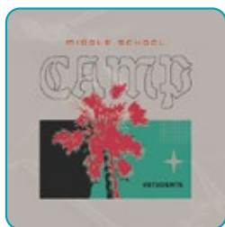
Middle School Camp 06.19 - 06.23 cbc.social/mscamp

Throughout the month of May, we are excited to love on various individuals who make an impact in our homes and communities. This weekend we kick things off by honoring the pastors of the Alamo City who have sacrificially stepped into God's unique calling for their lives. As a diverse and eclectic city, we are privileged to have over 2,000 churches that make up San Antonio and the surrounding areas. Join us as we pray together for these churches and the pastors who lead them so well!