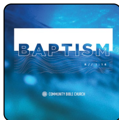
Baptisms 05.29 & 05.30 cbc.social/events