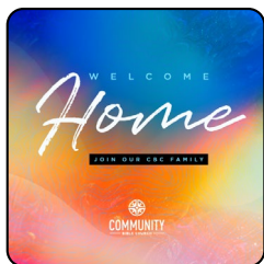
Welcome Home 05.24 cbc.social/events

You did it ! We are so proud of you and grateful that we can celebrate this incredible accomplishment with you. You put in the work, all those hours of dedication to reach this milestone. You have shown honor and integrity in your pursuit of this outstanding accomplishment and we can only imagine all that God is going to do through you!