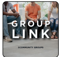
Group Link 07.11 & 07.18 cbc.social/events

SERVICE TIMES Saturday // 5 PM | Sunday // 9 AM, 11 AM, & 1 PM