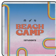
HSM Beach Camp 06.21 - 06.25 cbc.social/events