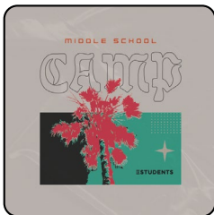
MSM Camp 06.19 - 06.23 cbc.social/events

There is no greater love, nor honor, that one has than trading their life for the freedom of another. The legacy of our fallen heroes will never tarnish or fade. They will live on through the lives they served and saved. In every memory and every story told, there will they be. We stand with you, the family and friends of our fallen heroes, and pray peace and strength over your hearts and minds. You are never alone, your CBC family sees you and loves you.