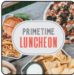
Primetime Luncheon 07.01 cbc.social/events