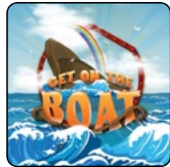
Vacation Bible School 07.19 - 07.22 cbc.social/events