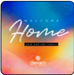
Welcome Home 06.28 cbc.social/events

As the Church, we focus on incarnational living within our individual neighborhoods, as well as our country neighbors in the south. In partnership with Reaching Across Ministries last weekend, a small group of skilled craftsmen traveled to Brackenville with the goal to represent Jesus and help a local family still suffering from the effects of economic downturns. The team installed a new kitchen floor and gutter system for the home and repaired a dilapidated sink and water pipes, while engaging with surrounding neighbors and the community church. Our CBC Global Border Trips are an affordable and accelerated opportunity to experience an Impact Trip close to home. To be involved with future Border Impact Trips, email cbcgloba1@cbc.email .