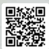
SCAN THIS CODE TO JOIN IN ON CHAMPIONING OUR SCHOOLS

As our students, educators and school staff head into a new school year, let's rally together to "Champion Our Schools"! This weekend, we honor and appreciate the incredible teachers who help raise up the next generation of leaders. Next Sunday, August 21 at 6:00pm we'll keep the support going as our CBC family gathers at various schools throughout our city to pray, asking God to cover our schools, students, educators, coaches, administrators, and support staff with protection and unity rooted in Truth. Scan the QR Code to choose your school and let us know you're joining us to pray!